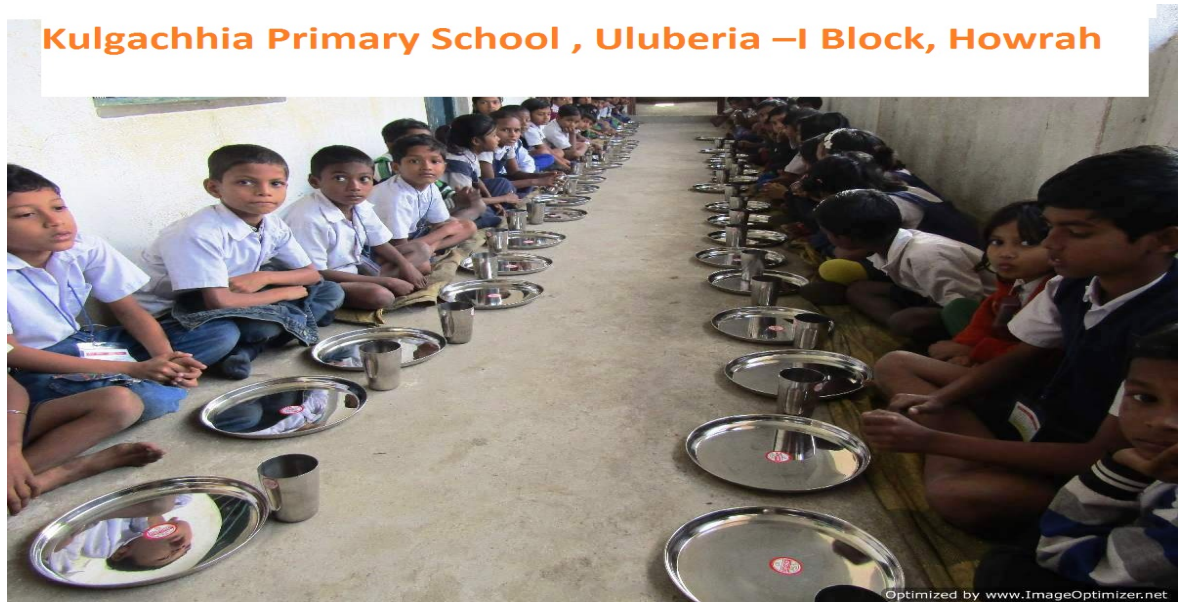
The students with plates and glasses provided by the state Govt. for MDM.