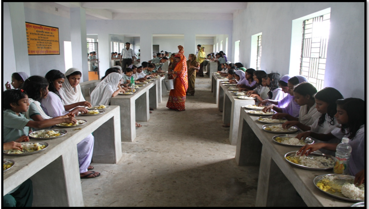
Dining at Dr Jakir Hossain High Madrasah under Tehatta-1 Block, Nadia