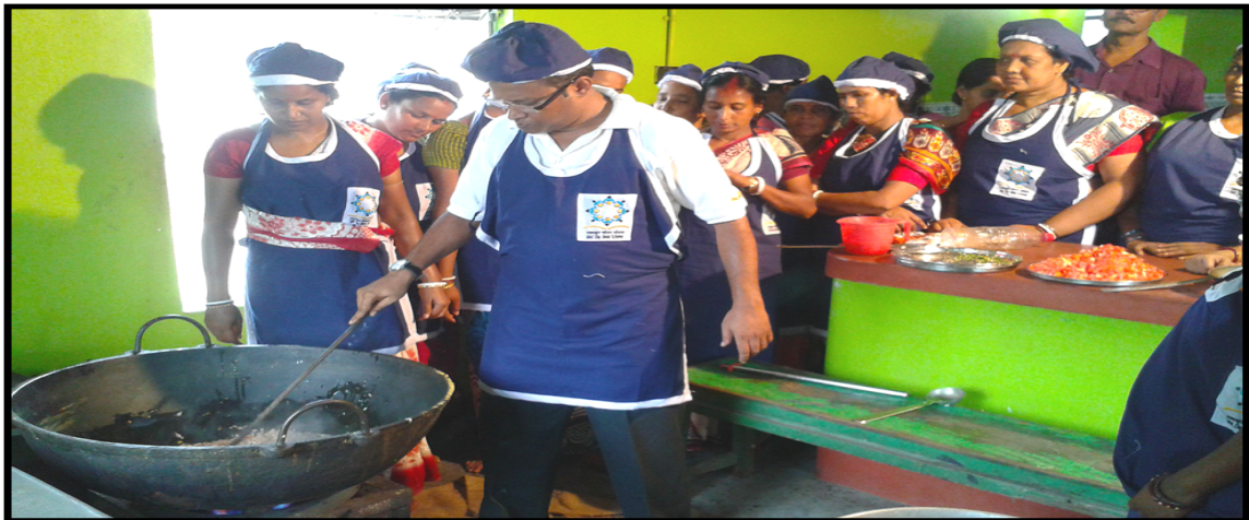
Training of Cook cum helpers by Hotel Management Institute, Hooghly